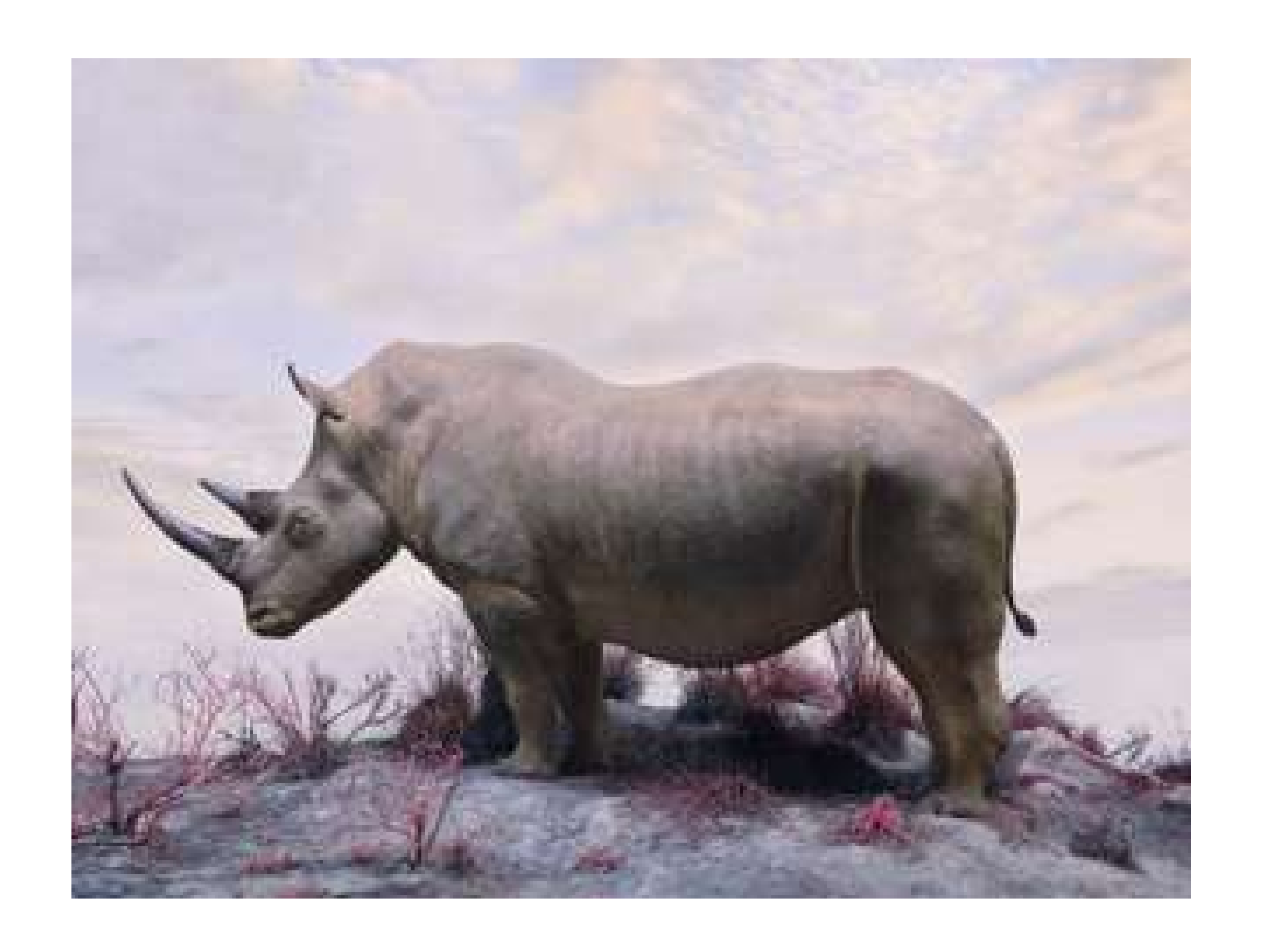
White Rhino L C Type Photographic Print 100 x 133 cm Edition of 5 plus 2 APs £5250