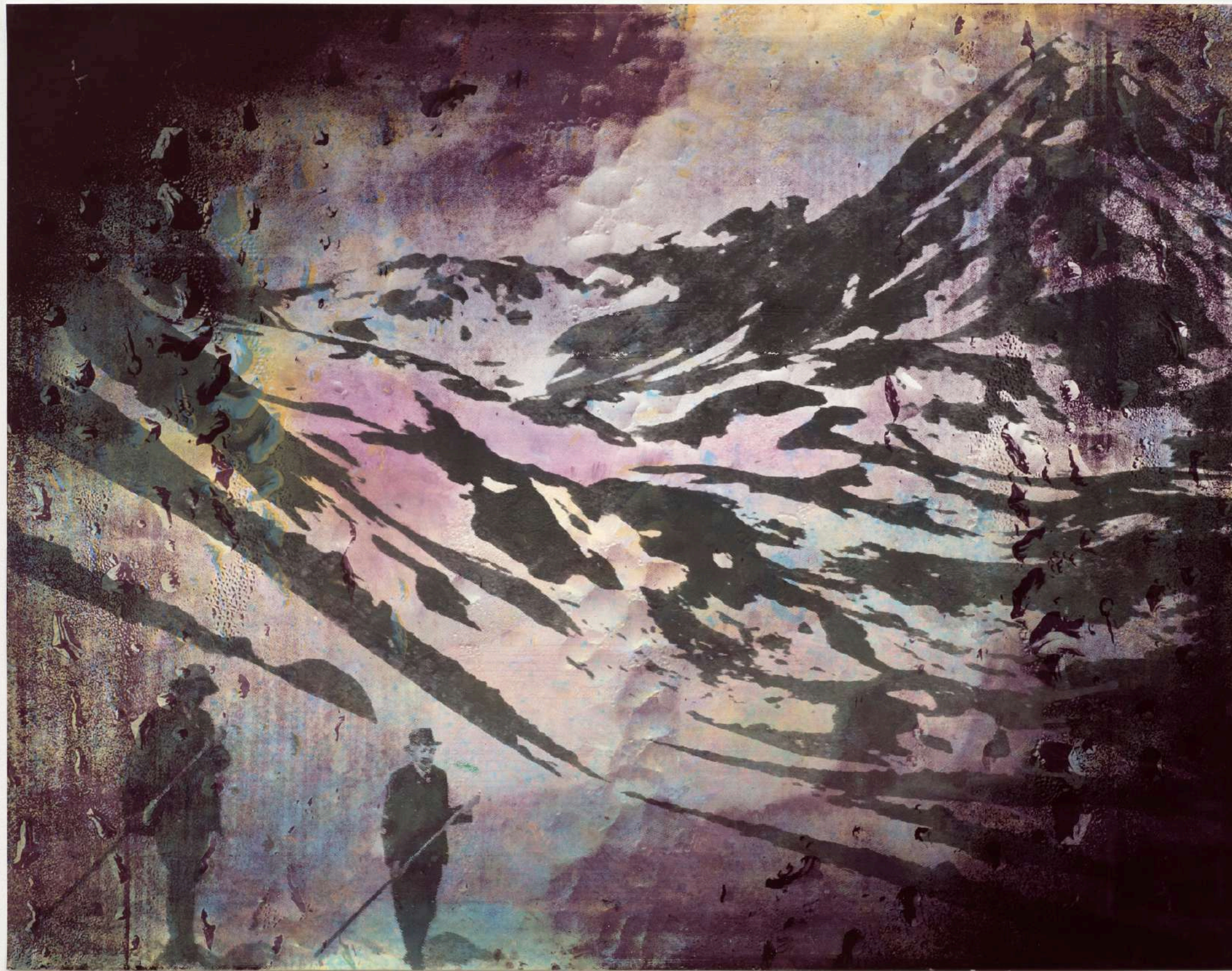
Descend 2017 Oil and screenprint on paper 148.5 x 188.5 cm £16,000