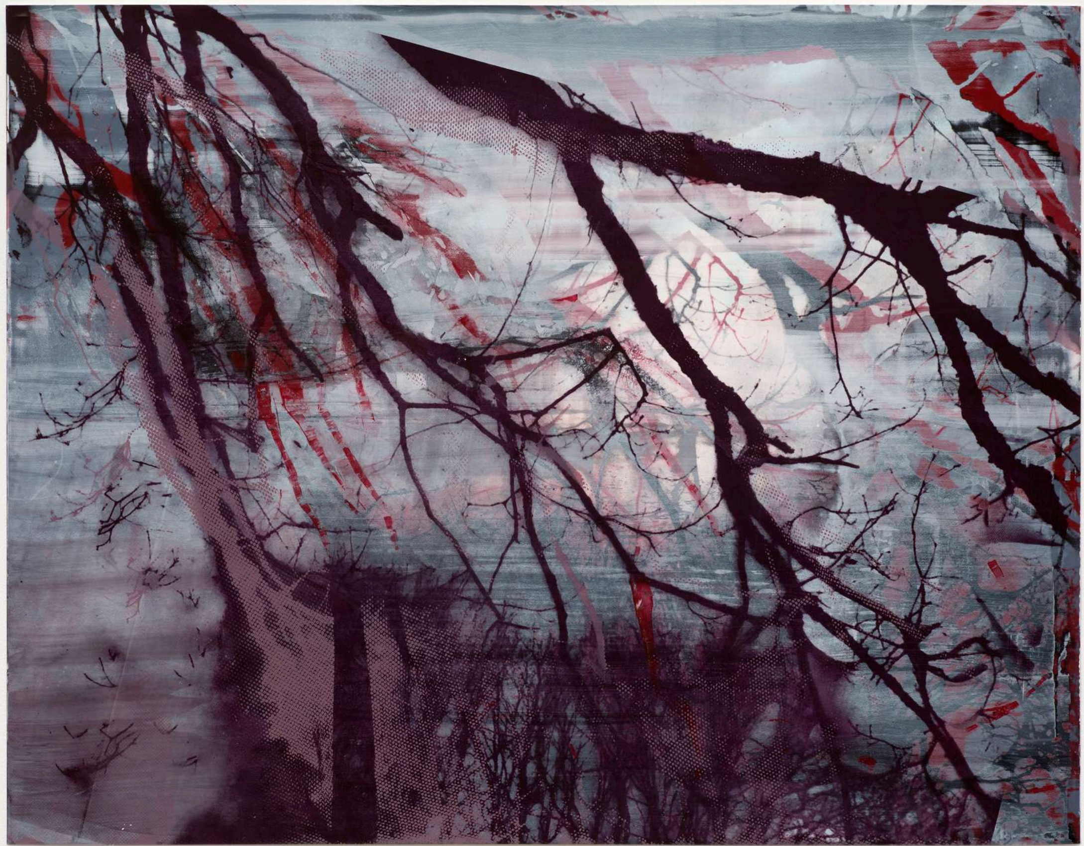
Of (2) 2017 Oil and screenprint on paper 148.5 x 188.5 cm £16,000