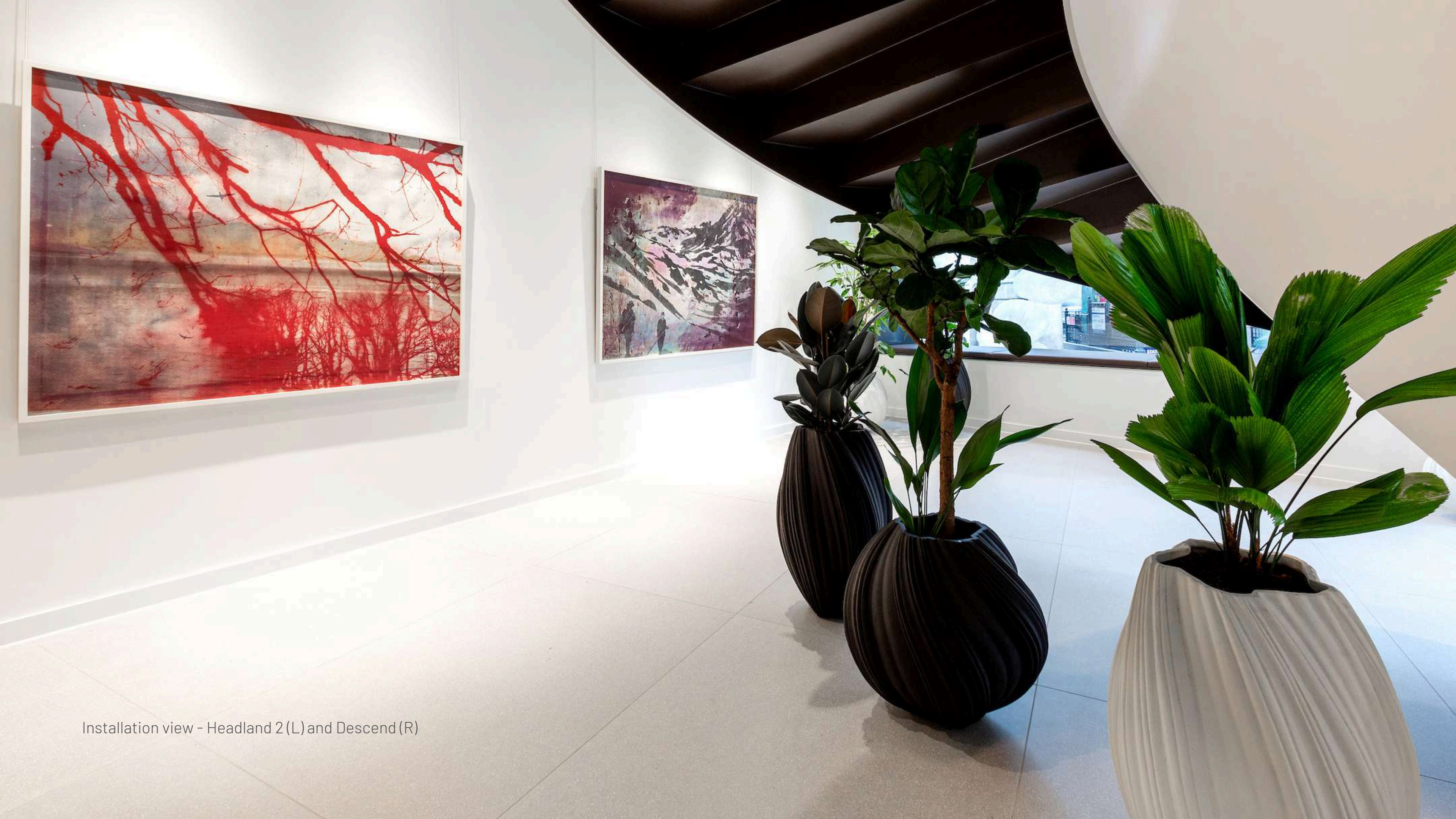
Installation view - Headland 2 (L) and Descend (R)