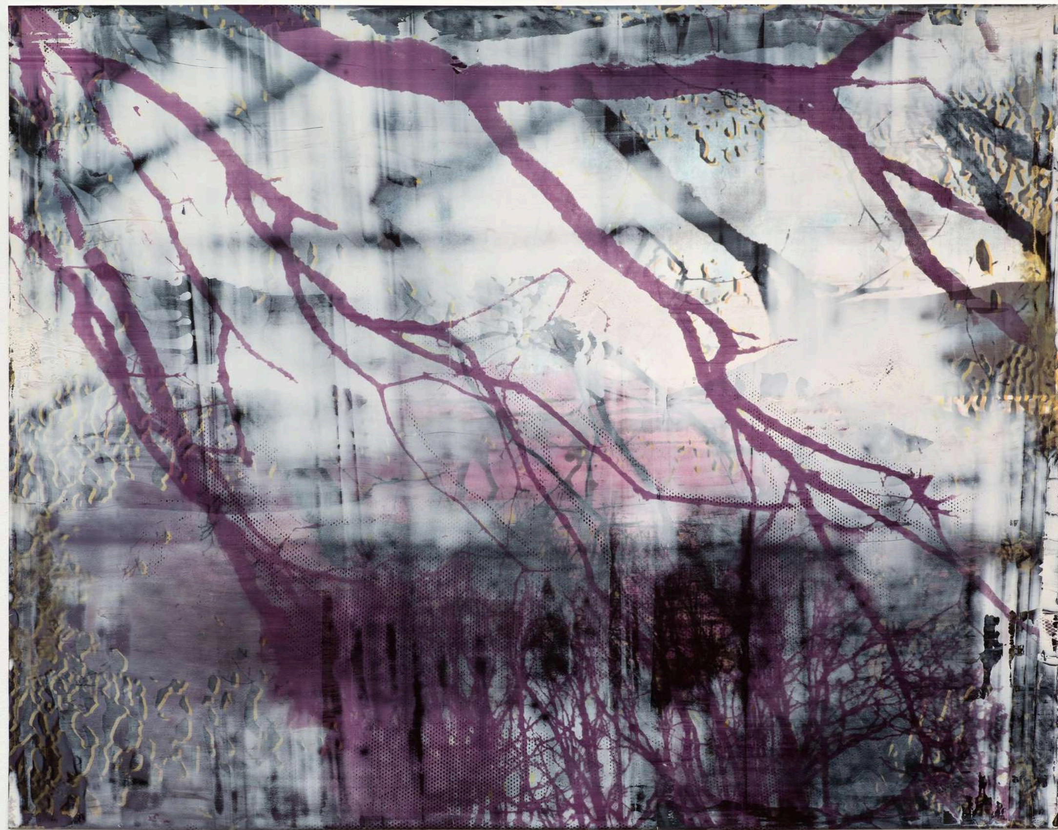
Of 2017 Oil and screenprint on paper 148.5 x 188.5 cm £16,000