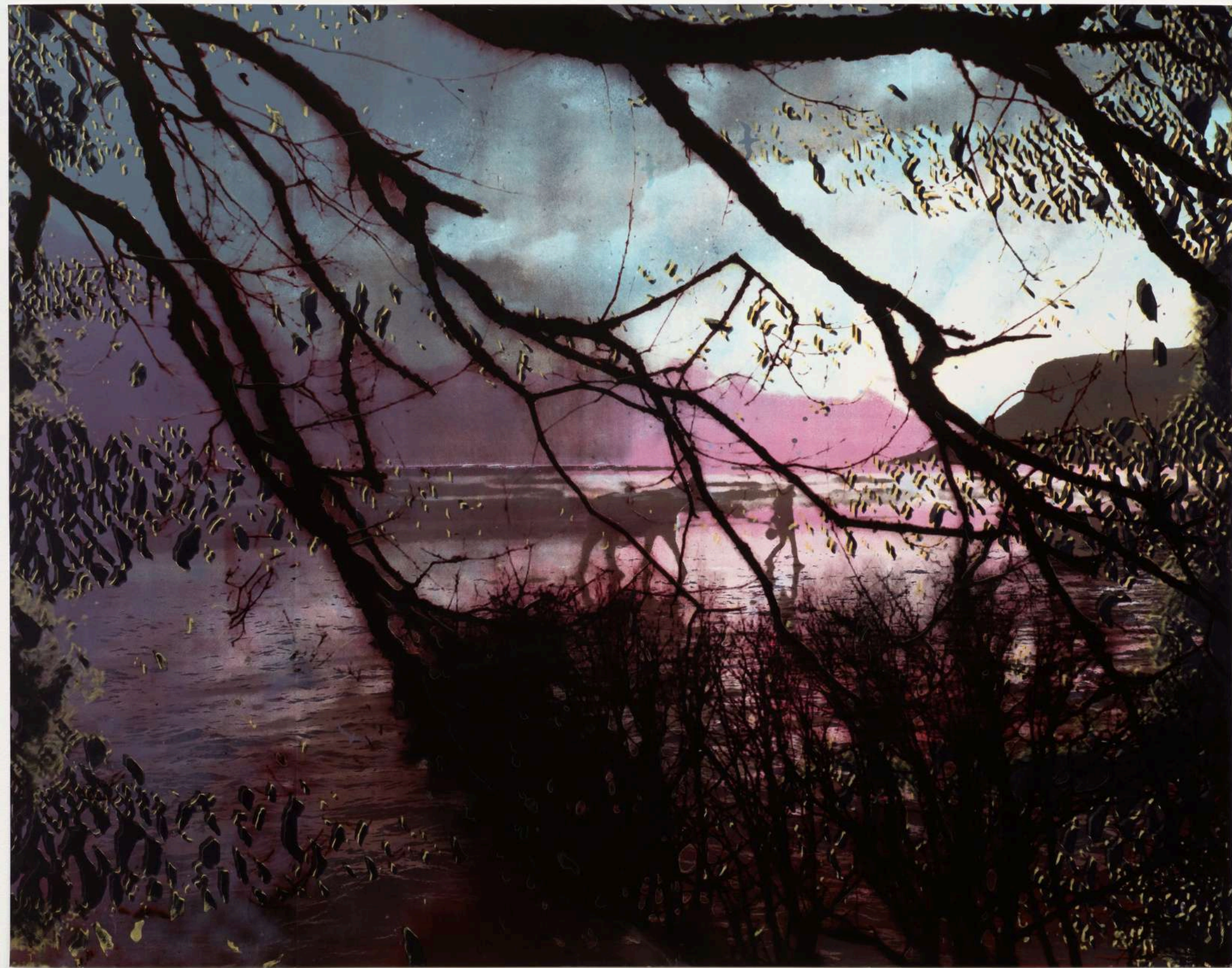
Black Bay 2017, Oil and screenprint on paper 148.5 x 188.5 cm £16,000